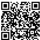
X600 SERVER 3D demo